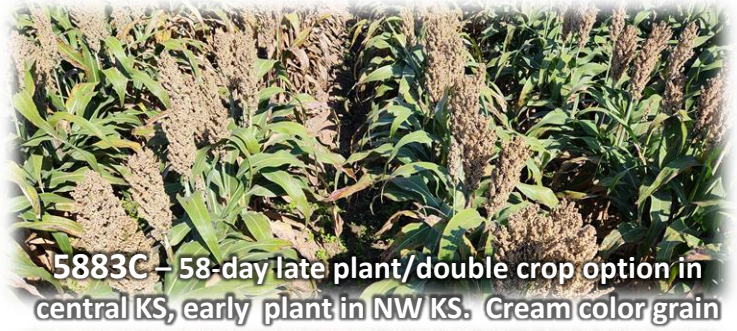
5883C – 58-day late plant/double crop option in central KS, early plant in NW KS. Cream color grain

Top picture is 5883C, and 637 is pictured below.