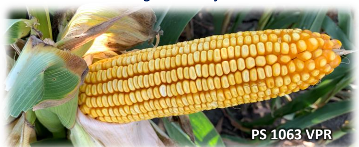
PS 1063 VPR