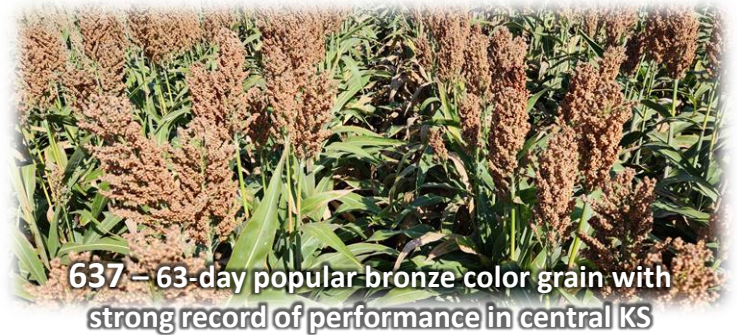
637 – 63-day popular bronze color grain with strong record of performance in central KS